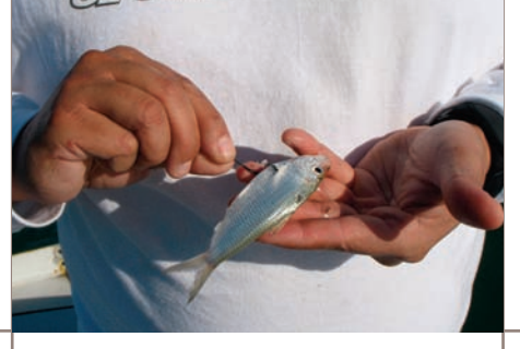
SJULL Low Magaz

If you are interested in exploring this fishery, I will make your job as easy as possible. Look closely at the finger channels just south of Stiltsville. The rocky shorelines around the Cape Florida Lighthouse and the shallow patch reefs off Elliott and Soldier Keys are also 'hot spots.' I have also connected with plenty of nice grouper along Hawk's channel, and regularly hear of outstanding catches coming from the deep holes on the flats.